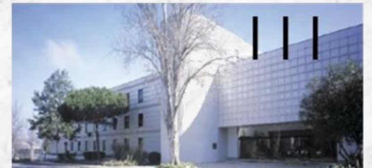
Location: 3I Building Av. Gama Pinto 1, Lisboa