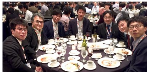
A table in AJK Fluids 2019 banquet

For these topics, 18 additional researchers were asgined as session organizers who chaired individual sessions to promote fruitful discussion among participants.