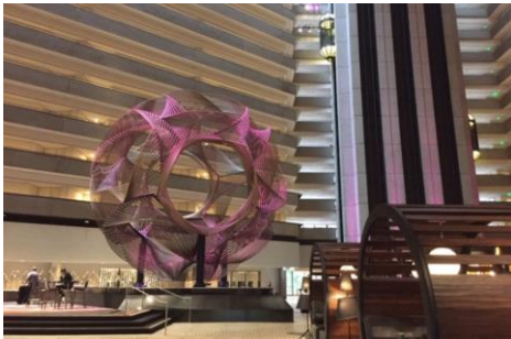
Hyatt Regency San Fransisco