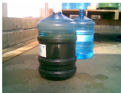
Figure 2. Flocculated microalgae.

After the settlement in the three tanks, the supernatant was separate from the flocculated material, which was packed in 0.02 m 3 bottles, as shown in Fig. 2.