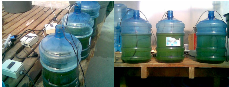
Figure 3. Experiment of temperature change.

To each gallon was added 5.0x10 -5 m 3 of 1.0 M NaOH solution, causing microalgae flocculation, and after settlement. The pH values were measured before and after sodium hydroxide addition, and the time to settlement was registered.