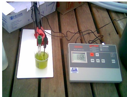
Figure 1. Equipment for pH measurement.

After the cultivation get a good cellular concentration, the flocculation by pH change tests were made. A 1.0 M (molar) sodium hydroxide (NaOH) solution was prepared. The tanks were maintained under agitation using an air pump positioned at their bottoms. The temperature was measured using a thermometer present in a digital oximeter. Was added to the tanks, slowly, the NaOH solution, controlling the pH with a digital pHmeter, as shown in Fig. 1.