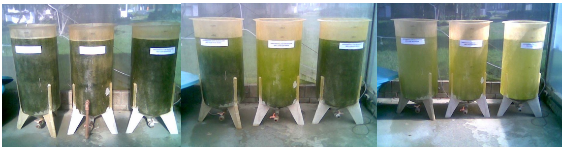
Figure 4. Change of pH experiments tanks before flocculation, during settlement and after settlement.

As shown in Tab. 5, the TQ-3 experiment presented lower decantation time. However the final pH was next of experiment TQ-1, was added greater quantity of NaOH in the third tank. A superior quantity of flocculant caused formation of biggest cells agglomerations, resulting in a best decantation.